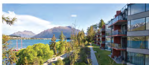
Anantara Vacation Club at Oak Shores Queenstown