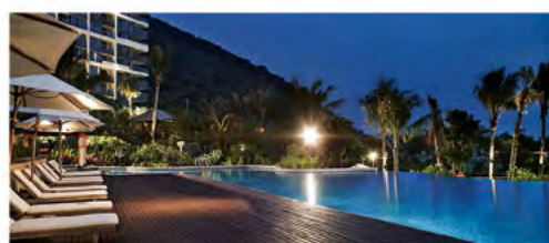
Anantara Vacation Club Sanya