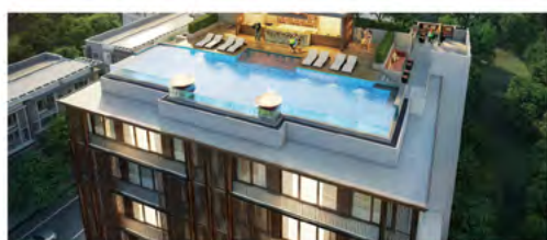
Anantara Vacation Club Chiang Mai