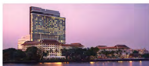
Anantara Vacation Club at Riverside Bangkok