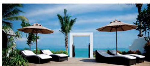
Anantara Vacation Club Bophut Koh Samui

YOU MAY BOOK BONUS BREAKS IN ANY OF THE FOLLOWING CLUB RESORTS: