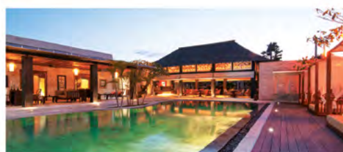
Anantara Vacation Club Seminyak Bali