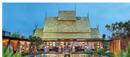
Anantara Vacation Club Mai Khao Phuket