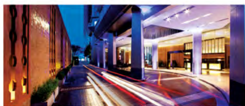
Anantara Vacation Club Sathorn Bangkok